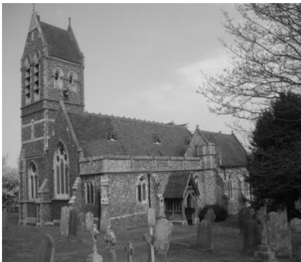
St. Peter and St. Paul, Ospringe