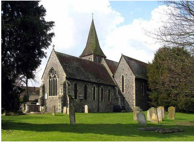
St. Catherine's, Preston-next-Faversham