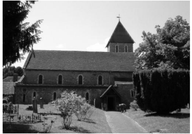
St. Mary Magdalene with St. Lawrence, Davington